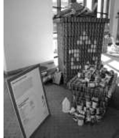
Who Can Recycle?

This year was the twelfth year of the National Canstruction® Sculpture competition which is organized by the Society of Design Administration as a joint public service activity. It is now international in scope with teams of design and construction professionals in dozens of cities across the United States as well as Canada , Columbia , Australia and New Zealand .