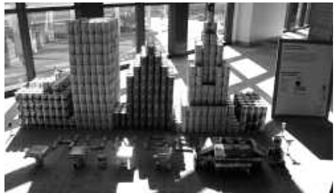
The Providence Skyline