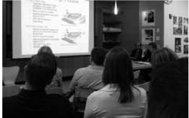
Salon Series: Geothermal - Digging Deeper