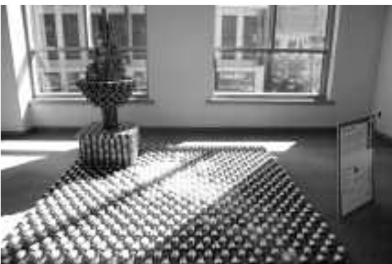
Lighting a Fire to End Hunger

AIARI and RISGL – Young Constructors Forum came together again this year for the second Canstruction® event to create CANTastic sculptures from CANS! We hope you all had the opportunity to visit the Providence Place mall between September 13 and 27 to view the impressive works that captured the attention of all who passed through the Mall-Westin connector corridor. This year, six teams joined forces to design, engineer and construct the themed sculptures using only cans. The event was judged and awards were presented at the Gala held on Wednesday, September 24, 2008 at the mall.