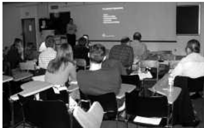
LEED "Lessons Learned" Seminar