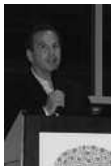
Providence Mayor David N. Cicilline