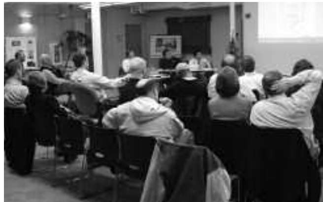
NFSA Fire Sprinkler Seminar