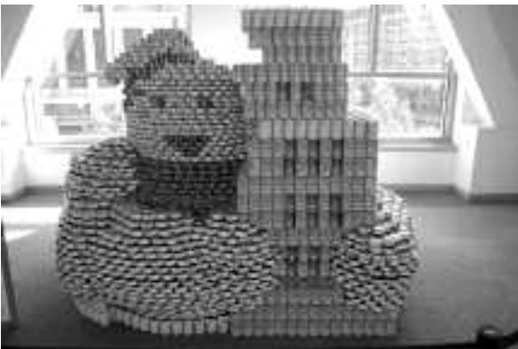
Stay-Puft Marshmallow Can